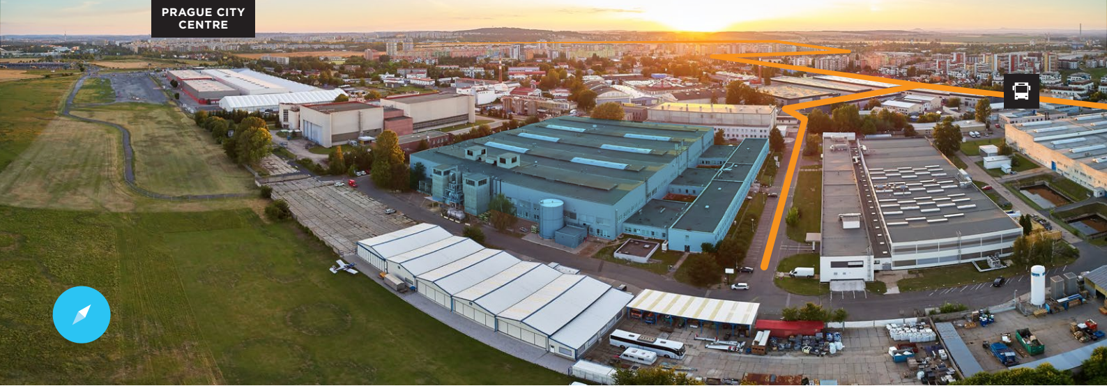
PRAGUE CITY CENTRE